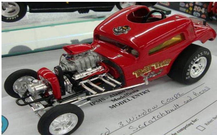
Charles Feuerborn's 1932 Ford