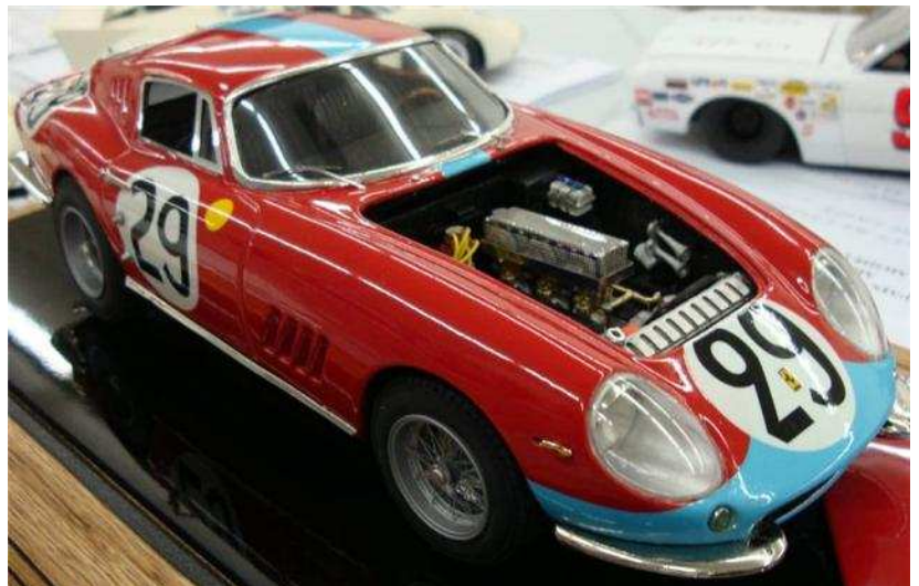
Ferrari